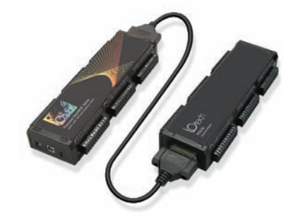
Personal Daq/3000 attached to a PDQ30 expansion module via a CA-96A cable