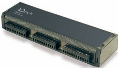
PDQ30, analog input expansion module

For complete product specifications, pricing, and accessory information, call 1-888-714-3272 (U.S. only) or visit iotech.com .