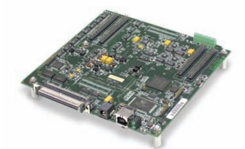
DaqBoard/3000USB, 16-bit/1-MHz USB data PDQ12, USB-powered extender cable acquisition board